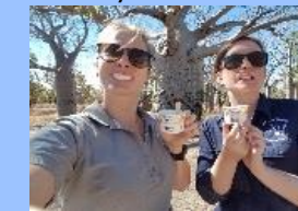
Priority 1 – food and where we eat it!

Call 89738778 or email Elaine.Jaeschke@nt.gov.au