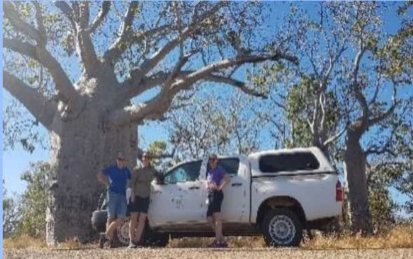
Our trusty (Hi)Luxy