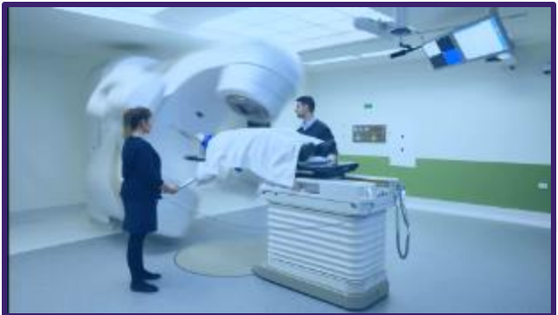
Video 1. Educational video given to radiotherapy patients